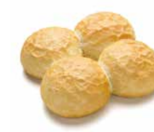
F60094 White Batched Crusty Rolls Light and moist batch white bread rolls with a golden crisp crust. Ideal for multi-buys.