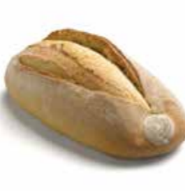
F60250 White Organic Loaf Crusty white bread made with organic flour. Includes bags and labels.

You can now order online at www.countrychoice.co.uk