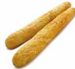
F60904 Tiger Parisienne A great tasting baguette with a distinctive golden cracked crust.