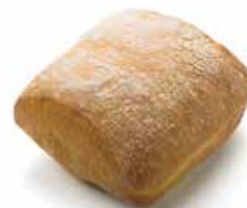
F60154 White Rustic Roll

Made in Northern Ireland with buttermilk and wholemeal wheat flour.