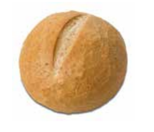
F60902 Brown Round Crusty Roll A soft moist textured brown roll with a crisp golden crust and rich in flavour.