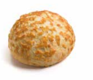
F60099 Tiger Roll Delicious white crusty roll named to reflect its distinctive golden 'cracked-crust' appearance.