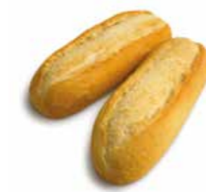
F60887 White Sandwich Baguette A crispy baguette with a soft and delicious centre, making it great for sandwiches. Made with French flour.