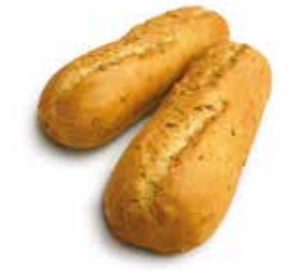
F60889 Harvest Grain Demi Baguette A delicious baguette with malted wheat flakes - great for sandwiches. Made with French flour.