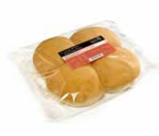
F60220 Large White Batched Baps Batch baked soft white baps made using British wheat.