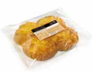
F60223 Large Cheese Batched Baps Batch baked soft white baps generously topped with cheese. Made using British wheat.