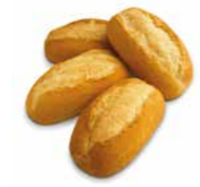
F60885 White Petit Pain A small roll with a crisp crust and soft, rich crumb centre. Made with French flour.