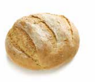
F60926 Malted Grain Cob A stone baked malted grain cob decorated with three top cuts, lightly dusted with rye flour.