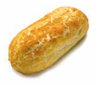
F60190 Tiger Bloomer Delicious crusty loaf appropriately named to reflect its distinctive golden 'cracked-crust'.

You can now order online at www.countrychoice.co.uk