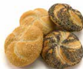
F4861 White Kaiser Rolls

An Italian style white roll enriched with extra virgin olive oil, produced using an aged dough to provide a light and open texture.