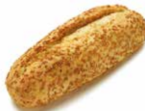
F60539 Seeded Bloomer

Crusty white bloomer with crispy fried onion and red onion inclusions.