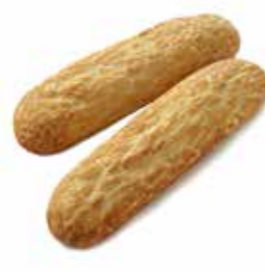
F60879 Tiger Demi Baguette A white crusty baguette with a distinctive flavour and a unique golden cracked crust.