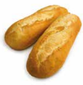
F60888 White Demi Baguette Our best selling baguette with a crisp crust, soft centre and unique flat base. Made with French flour.