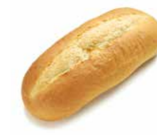
F60927 White Bloomer A small white bloomer with a firm and moist crumb decorated with an attractive centre cut.