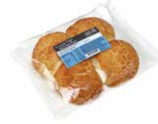
F60224 Large Tiger Batched Baps Batched baked soft white baps with a tiger paste topping. Made using British wheat.

F Bread suitable for filling T Thaw and Serve W Individually wrapped