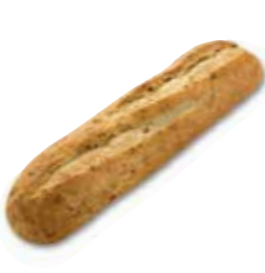
F60012 Onion Sandwich Baguette A white sandwich baguette with tasty onion pieces, a crisp crust and soft centre. Made with French flour.