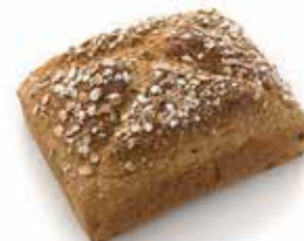
F60054 Wheaten Loaf

Crusty white bloomer with golden linseeds, sunflower, pumpkin and millet seeds.