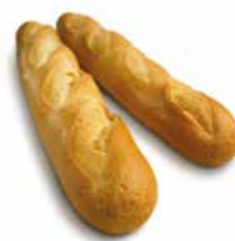
F60890 Parisienne Our large baguette, providing a crisp crust with a soft centre and a rich flavoured crumb. Made with French flour.