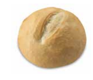
F60900 White Round Crusty Roll A light and airy-centred white roll with a crisp crust.