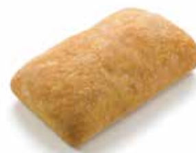
F60152 Sandwich Ciabatta

A rustic shaped crusty roll with white flour, enriched with aged dough.