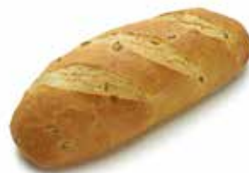
F60537 Olive Bloomer

Crusty white bloomer with Spanish green olives.