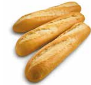
F60459 Small White Baguette Small White Baguette with a crisp crust and soft centre. Made with French flour.