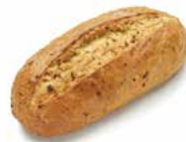
F60538 Onion Bloomer

Crusty white bloomer with Spanish green olives.